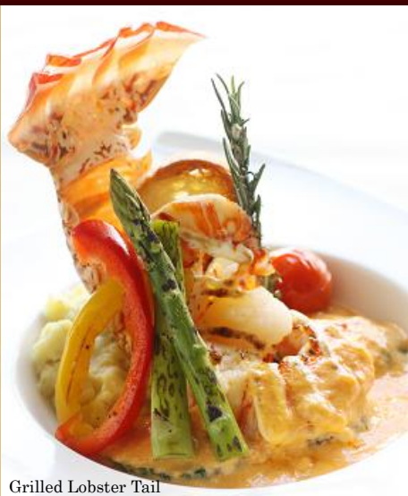
Grilled Lobster Tail

"Premium Wagyu" KOBE Beef Steak (8oz) 58 Potato, Zucchini, Bell pepper, Asparagus, Cherry Tomato with Ponzu Sauce & Mustard Sauce