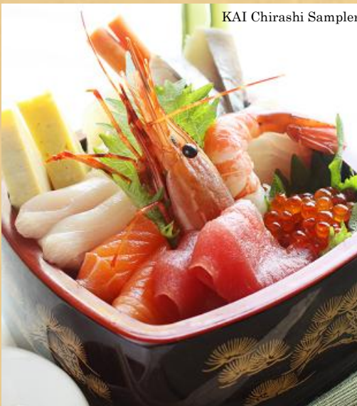
KAI Chirashi Sampler

Kids Plate $14 Teriyaki Chicken or Teriyaki Salmon Green Salad / Rice/ Edamame / Grilled Corn / Nigiri(Shrimp) / Fruit Jelly +$2 Change Entree to Rib Eye Steak(2oz)